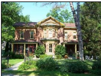
Kimmell House Inn B & B