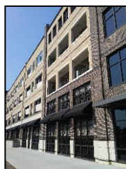
New Lincoln Highway Garage