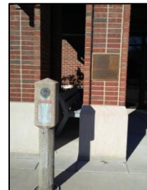
LH post and commemorative plaque