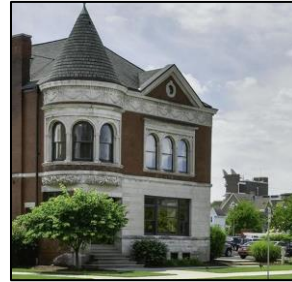
Remedy Building - LH post in lower right corner

In 2007, the Lincoln Highway Association established a national headquarters in South Bend in the lower level of the 1895 Remedy Building on Washington Street, then owned by Indiana Landmarks. A dedication ceremony was held, which included erecting a reproduction concrete post.