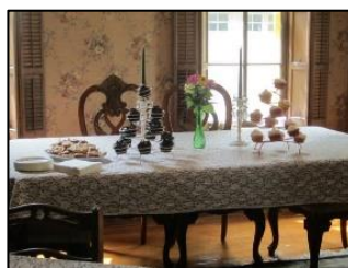
Kimmell House Dining Room