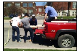
Post slightly damaged during digging; being loaded onto truck.

In 2017, Indiana Landmarks sold the Remedy Building and moved to the carriage house of the Kizer mansion, four blocks west on Washington St. A group of Notre Dame students participating in a Community Service day dug up the marker and brought it to the carriage house garage where it languished for several years.