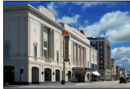
The Lerner Theatre and Hotel Elkhart

As you know we are hosting the 2024 National Conference for the Lincoln Highway Association here in Indiana. The beautifully restored Hotel Elkhart will serve as the host hotel and participants will spend the week on tours across northern Indiana and with expert presentations on the history of important roads, camping, indigenous peoples, and much more.