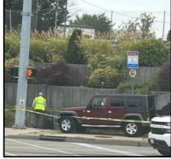
West tier before work – 2023